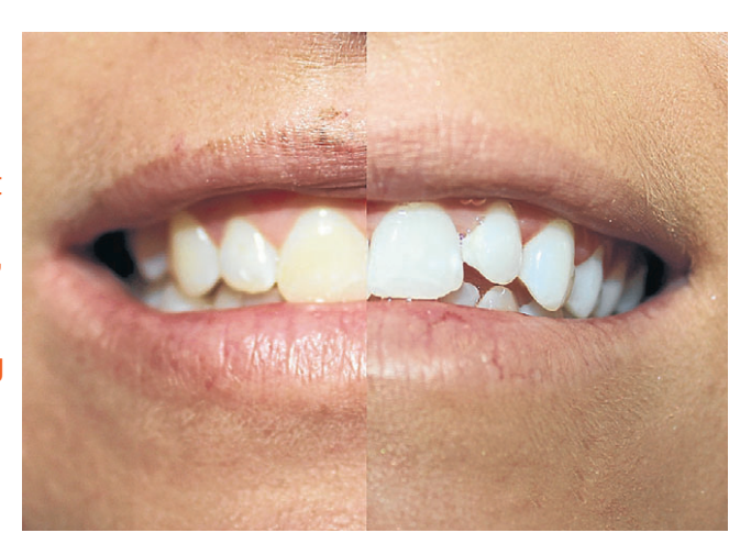
Actual in-house result of a current patient at CBD Dental.

constantly being stained from common foods and drinks that you consume, so once your have lightened your teeth, you will need further treatment if you wish to maintain the new lighter, brighter smile.